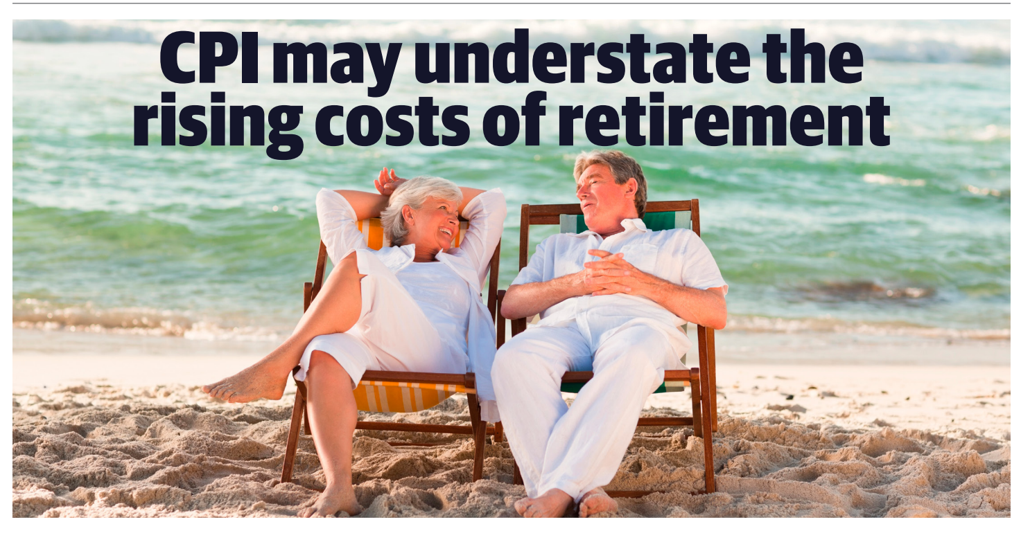
BY HARRY CHEMAY Republished from firstlinks.com.au

he post-lockdown resurgence of the Australian economy between 2021 and 2023 brought with it a confluence of inflation-inducing effects.